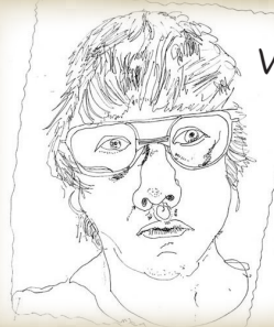
William T. Vollmann

Headliner Reading Bing Crosby Theater 4/11, 7pm